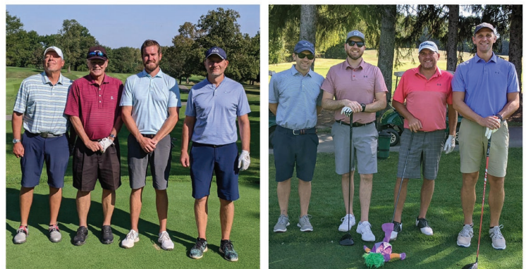
Photos left to right: Park National Bank team, Lighthouse Management team.